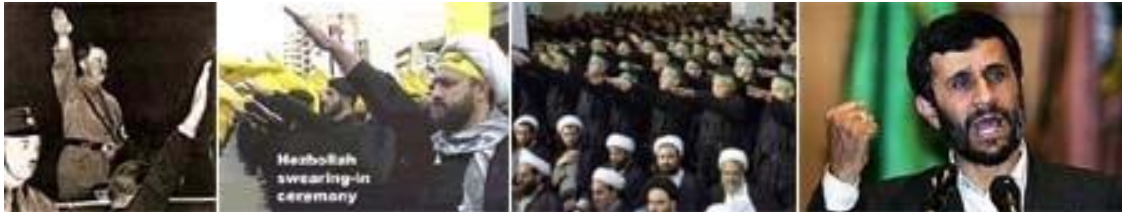
Left to right: Adolf Hitler, Nazi salute; Hezbollah swearing-in ceremonies in Iran; Iranian President Mahmoud Ahmadinejad.

But the Mufti's Nazi heritage did not end with the Holocaust.