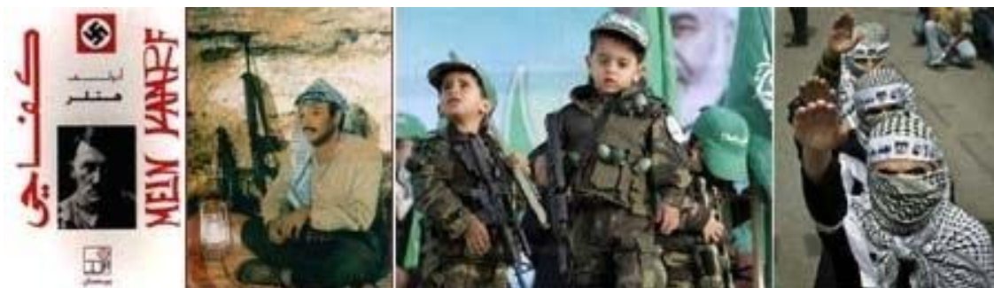
Left to right: Arabic edition of Adolf Hitler’s “Mein Kampf” distributed by Palestinian Authority in 2003; Yasser Arafat in Fatah militia; Hamas children in military indoctrination; Palestinian Fatah militia salute.

Palestinian National Charter, Articles 9 and 15